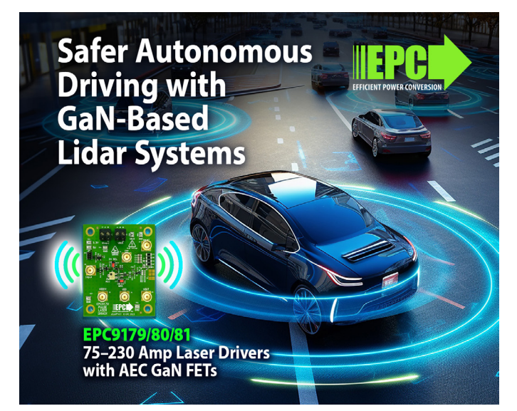
Figure 02 – GaN Laser diode control in nanoseconds for advanced automotive autonomy

LiDAR, an acronym for "Light Detection And Ranging" is a technology that uses laser pulses to map out an environment. When the pulse contacts an object or obstacle, it reflects or bounces back to the LiDAR unit. The system then receives the pulse and calculates the distance between it and the object based on the elapsed time between emitting the pulse and receiving the return beam. LiDAR systems are capable of processing