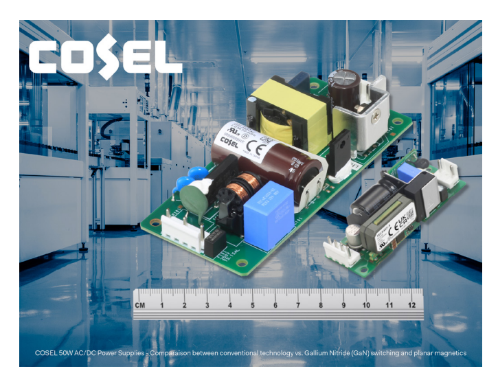
Figure 06 – COSEL industrial power supplies adopting GaN and integrated magnetics make it easier to integrate in small space environment

Due to that, the adoption in industrial, railway and medical applications may be slower than in EV, ICT and consumers but the obvious benefit of WBG motivated designers to explore that way. One example is the outcome from COSEL research to combine digital control, GaN and planar magnetics that makes it possible to offer very compact power solutions that are easy to integrate into small space environments (Figure 06). That will make it possible to house the power supply and a battery backup in the same volume as the conventional version of a similar power supply. As we are moving forwards to new applications requiring higher performances, WBG will gain market shares and follow the same path followed by the early adopters.