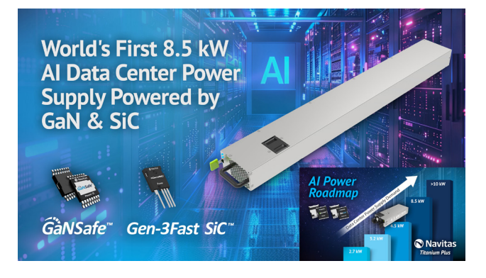
Figure 05 – WGB contributes to efficient power supply for AI datacenters

predicted that power demand per unit will ultimately reach 10kW (Figure 05 insert). Exploring the optimum benefits of combining GaN and SiC, the company released a 8.5kW, 98% efficiency reference design, complying with the with Open Compute Project (OCP), Open Rack v3 (ORv3) specifications and ready for stringent energy efficiency standards (Figure 05). This is a good representation of what has been achieved when combining WBG and other advanced technologies to power today and tomorrow ICT applications and more to be expected.