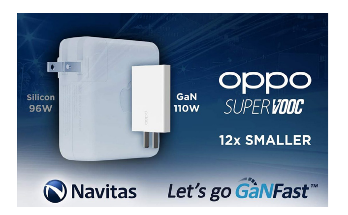
Figure 03 – Implementing GaN into USB-C chargers makes possible to reduce size weight whilst increasing power density and efficiency

When first presented, WBG power semiconductor utilization was limited by the number of drivers available, making it difficult for power designers to consider the technology. Also, new technologies are always questioned regarding reliability and sustainability. Market adoption