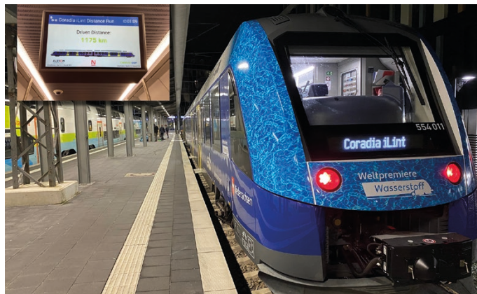
Figure 04: Alstom Coradia iLint.

The original project included a large array of solar panels to power electrolyzers generating hydrogen for an autonomous refueling station for cars and utility vehicles. Exploring the large range of possibilities offered by this technology, the station could also use the stored hydrogen to supply a fuel cell to generate electricity. The oxygen resulting from the split process in the electrolyzers is captured and stored for medical, industrial or farming applications. This autonomous station is a good example of what could be deployed at a larger scale and even to generate hydrogen for other vehicles such as local trains as Alstom demonstrated in August 2021 with the first passenger train in the world powered by hydrogen, the Coradia iLint which made its debut at Östersund in Sweden. Since then the Coradia iLint began regular operations in Germany, and in September 2022 travelled 1,175 kilometers without stopping to refill its hydrogen tank (Figure 04).