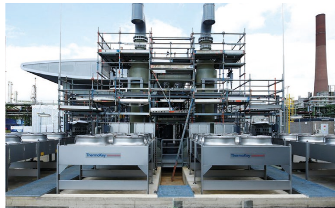
Figure 05: Shell's Energy and Chemicals Park near Cologne (Germany.