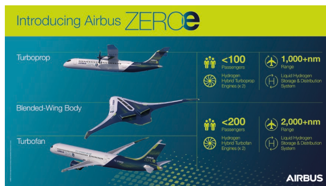
Illustration 02 – AIRBUS Zero emission airplane powered by Hydrogen

Amongst the projects and initiatives we should mention one very interesting study, commissioned by Clean Sky 2 and Fuel Cells & Hydrogen 2 Joint Undertakings on hydrogen's potential for use in aviation. Using hydrogen in aeronautics will require a huge amount of technical innovation and a new infrastructure, but it is seen as a major step forwards in the reduction of CO2 emissions from the aviation sector. The airplane manufacturer AIRBUS took part in the study and it's worth mentioning the company's ambition to develop the world's first zero-emission commercial aircraft by 2035 (illustration 02).