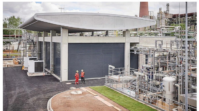
Illustration 04 – Germany / Wesseling EU largest PEM electrolyzers

Hydrogen is no longer a myth and Jules Verne's vision: "Water will one day be employed as fuel, that hydrogen and oxygen which constitute it, used singly or together, will furnish an inexhaustible source of heat and light, of an intensity of which coal is not capable" will become a reality.