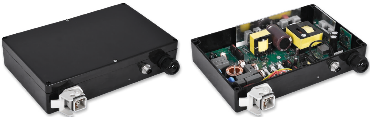
Figure 02 – PRBX ENI250A24 designed for high speed e-commerce hubs conveyers with microprocessor controller and energy recycling

Traditionally, below 1000W, DC motors are powered by a single phase AC/DC power supply. Though to simplify installation, reduce unbalanced phase loading and for better optimization of energy from the grid, parcel hub designers now require that all power supplies for DC motors have a three phase input, and for whatever the power level. Also, considering energy saving and reducing peak-loads, hub designers require power supplies to include peak energy control and energy storage, thus able to store energy when motors are decelerating or stopping, but also to deliver high energy levels when DC motors are activated. This is usually achieved by capacitors or supercapacitor banks partly controlled by the microprocessor in charge of the power supply energy management (Figure 02).