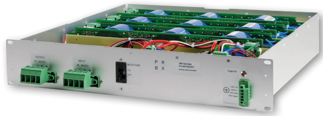
Figure 04 –PRBX 29F supercapacitor energy peak and backup unit replacing battery in demanding applications.

Safety is another benefit of supercapacitors and that is the reason why they are the first choice when backup or