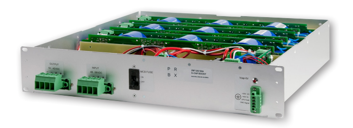
Figure 04 –PRBX 29F supercapacitor energy peak and backup unit replacing battery in demanding applications.

Safety is another benefit of supercapacitors and that is the reason why they are the first choice when backup or