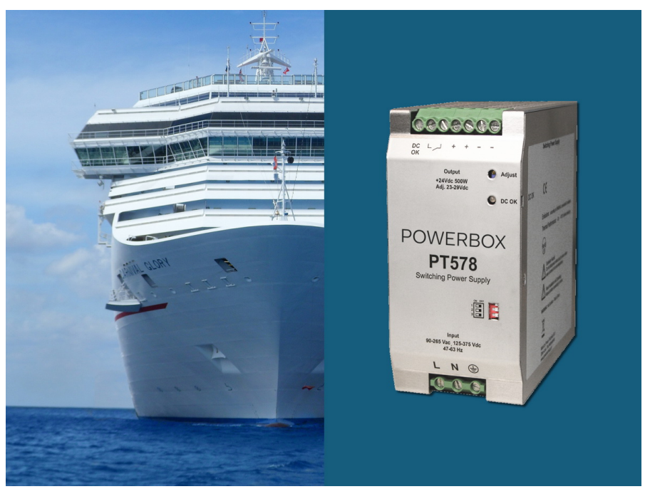
PRBX PT578 Marine Line 500W power supply

Related link: Marine Line 500 – PT578 https://www.prbx.com/product/pt578-series/